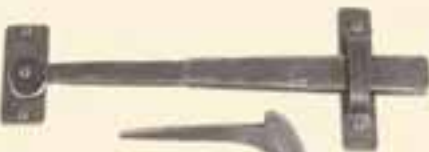
Hadlyme standard trim 10" L bar.