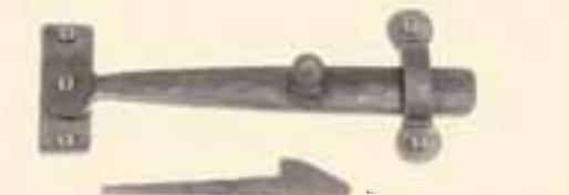
Norfolk standard trim 7 1/2" L bar.